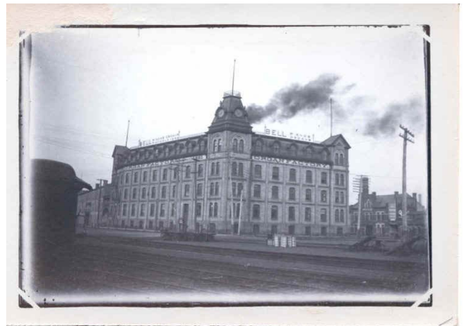
The Bell factory on Carden St. near downtown Guelph employing 100 men 1881. The bell tower was added in 1882. From the Guelph Public Library archives C6-0-0-0-492 entitled "Bell Piano and Organ Company".