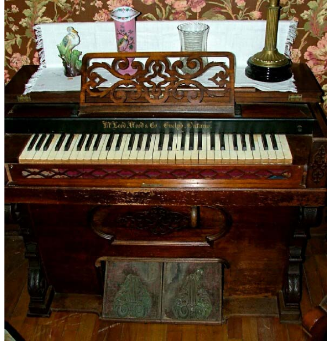
Above is a McLeod, Wood & Co small organ that was also made in Guelph during the 1860's. The Bell and McLeod merger added the McLeod organs to Bell's product line in 1867.

The Bell Company also made musical games booklets. These booklets contained the music for games such as London Bridges and some included a brief description of the accompanying game. Bell made instructional manuals on piano playing. These included basic lessons on music theory, exercises, and sheet music. Overall the Bell Company produced everything a player needed for learning and playing a piano or organ.